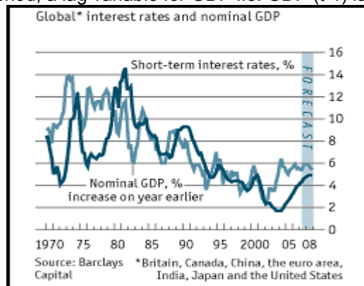
Figure 2: Nominal GDP (t-1) and Nominal Interest Rates (t) for a group of big economies

In actual distribution of income between financier and finacee, profit sharing ratio would be used and agreed upon at time (t) and applied to the actual gross profit earned by the finacee in time period (t+1). In Figure 2, data for the period 1970-2008 for a group of big economies i.e. America, Britain, Canada, China, the euro area, India and Japan is shown on the variables Nominal Interest Rates (t) and Nominal GDP Growth Rate (t-1) since Nominal GDP responds to interest rate changes as it decreases aggregate demand for the subsequent period, a lag variable for GDP i.e. GDP (t-1) is taken.