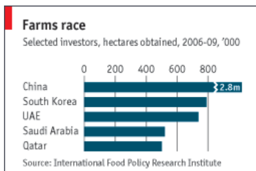
Figure 1: Farm Race

Constant returns to scale are assumed as the GoP is planning to lease this unutilized farmland to Middle East and European investors whose involvement is expected to increase productivity. Their interest in agriculture to achieve food security is evident from the Figure 1 given below: